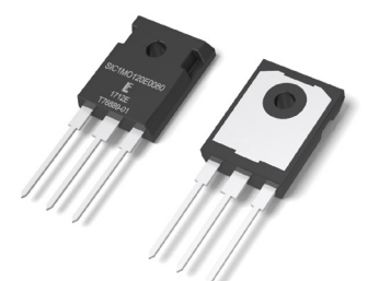
Figure 1. SiC based devices, like this 1200 V 80 mOhm MOSFET from Littelfuse, are optimized for high power, low resistance, and low power conversion losses not available with traditional silicon devices.

SiC MOSFET devices are now available that blend high operating voltages and fast switching speeds, a combination typically not available with traditional power transistors. To be useful in automotive charging applications, they must operate at high junction temperatures and feature low gate resistance, low gate charge, low output capacitance and ultra-low on-resistance. Designers prefer devices that offer high power density and reduce the size and weight of filter components, which reduces cost and space requirements.