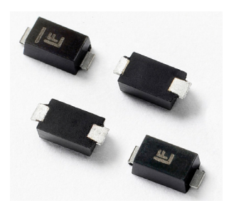
Figure 3. TVS Diodes like this <u>SMF Surface Mount Series</u> device from Littelfuse are designed specifically to protect sensitive electronic equipment from voltage transients induced by lightning and other transient voltage events.

"Designing safer, more efficient and reliable charging stations" as published in Charged Electric Vehicles magazine (June 2020)