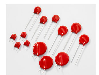
Figure 2. Some varistors, like those in this <u>UltraMOV Metal</u> <u>Oxide Varistor Series</u> from Littelfuse, are designed for applications requiring high peak surge current ratings and high energy absorption capability.

Download the guide, Supercharged Solutions for: EV Charging Stations